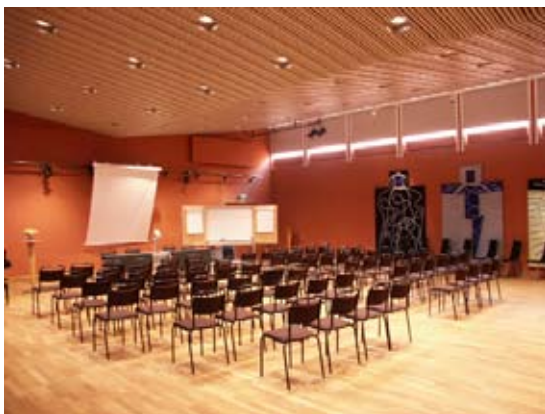
The conference room "Bo Linde" with 80-150 seats