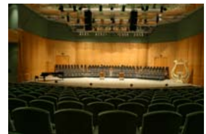
The main auditorium "Gevalia" with 819 seats