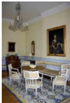
The castle of Gävle

The university has several conference rooms including an auditorium with 425 seats.