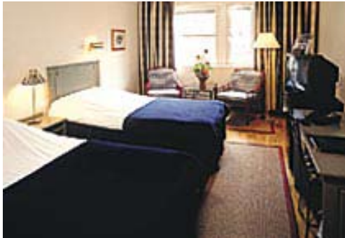
Clarion Hotel Winn