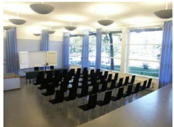
The conference room "Suite Boulogne" with 30-60 seats