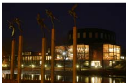
The symposium centre "Gävle Concert Hall"