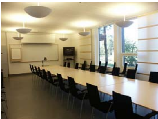
The conference room "Imagine" with 40 seats