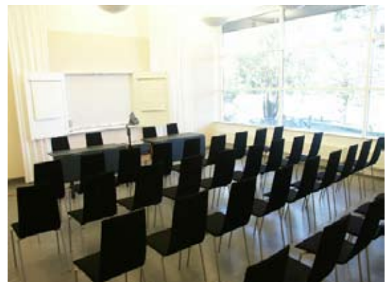
The conference rooms "Solitude" and "Cavatina" with 24-30 seats each