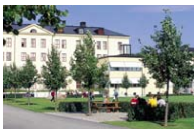
The University of Gävle

The university has several conference rooms including an auditorium with 425 seats.